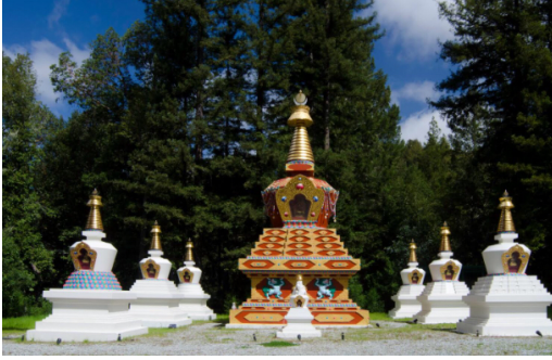
Red Dorje Drolu Stupa Mandala Today