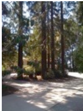
Stretch of road put in summer retreat, 2009